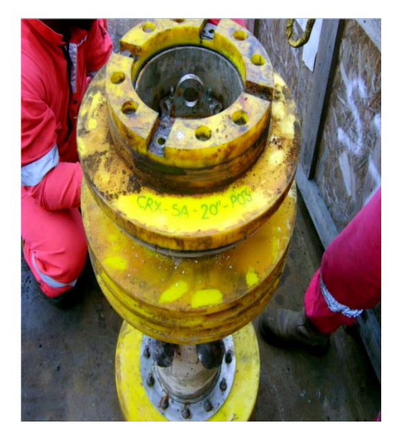
Figure 6—A 20-in. bi-di pig recovered from Segment A

When the subsea structures were prepared for installation in 2014, the subsea PLRs on Segment A and B pipelines were recovered, and the pigs were removed (Figure 6). There was an unexpected volume of dirt collected by the pigs, necessitating a fast-tracked pigging operation before the installation of the subsea structures.