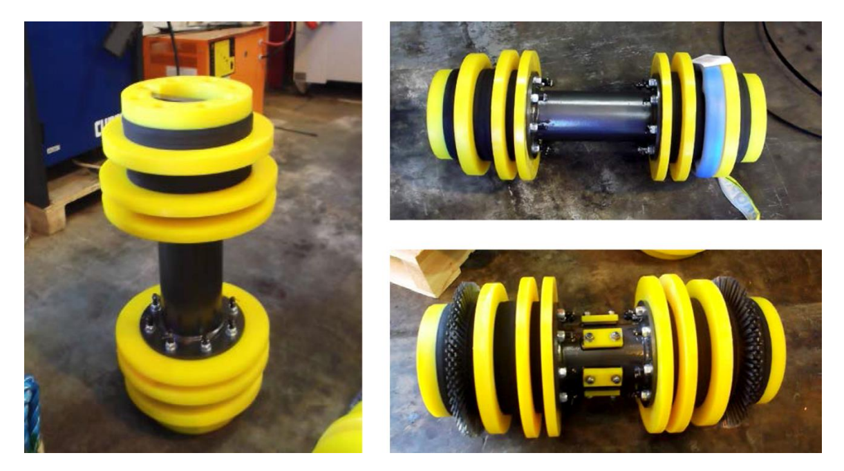
Figure 4—Segment W 12-in. bi-di pigs

Following completion of the flooding operation, a caliper pig (Figure 5) was scheduled to be run to provide a baseline survey. Unfortunately, the pre-commissioning of Segment W was cancelled because of unforeseen events.