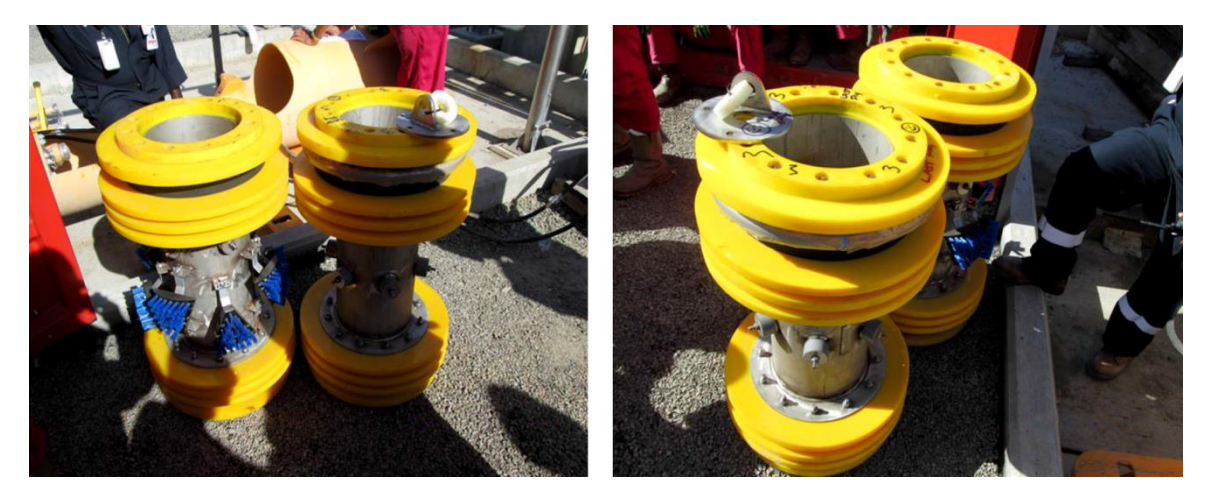
Figure 1—Segment C 22-in. bi-di pigs

All pigs were separated by 500 linear meters of seawater filtered to 50 microns, and the final gauge pig slug was treated with a chemical cocktail consisting of biocides and oxygen scavenger at 500 ppm to provide protection to the line for 24 months.