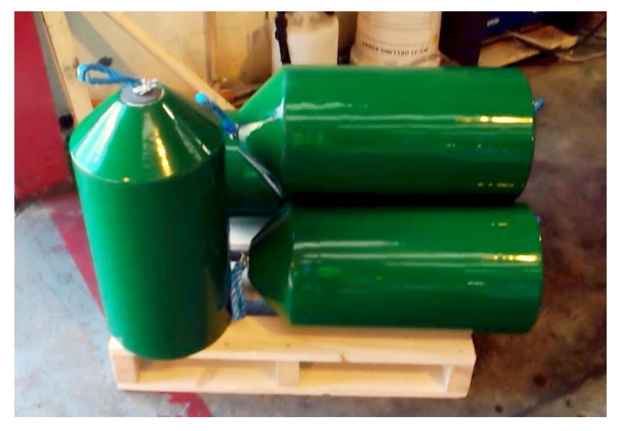
Figure 3—Segment W 12-in. foam pigs

The purpose of the pre-flood was to help eliminate the possibility of trapped air at hydrostatic pressure residing in the line because at -1400 m the air could be compressed by the hydrostatic conditions to 140bar. As this air travels through the conduit and ascends the NPP riser, it could expand, and depending on the volume, it could pressurise the conduit to pressures possibly attaining 140 bar.