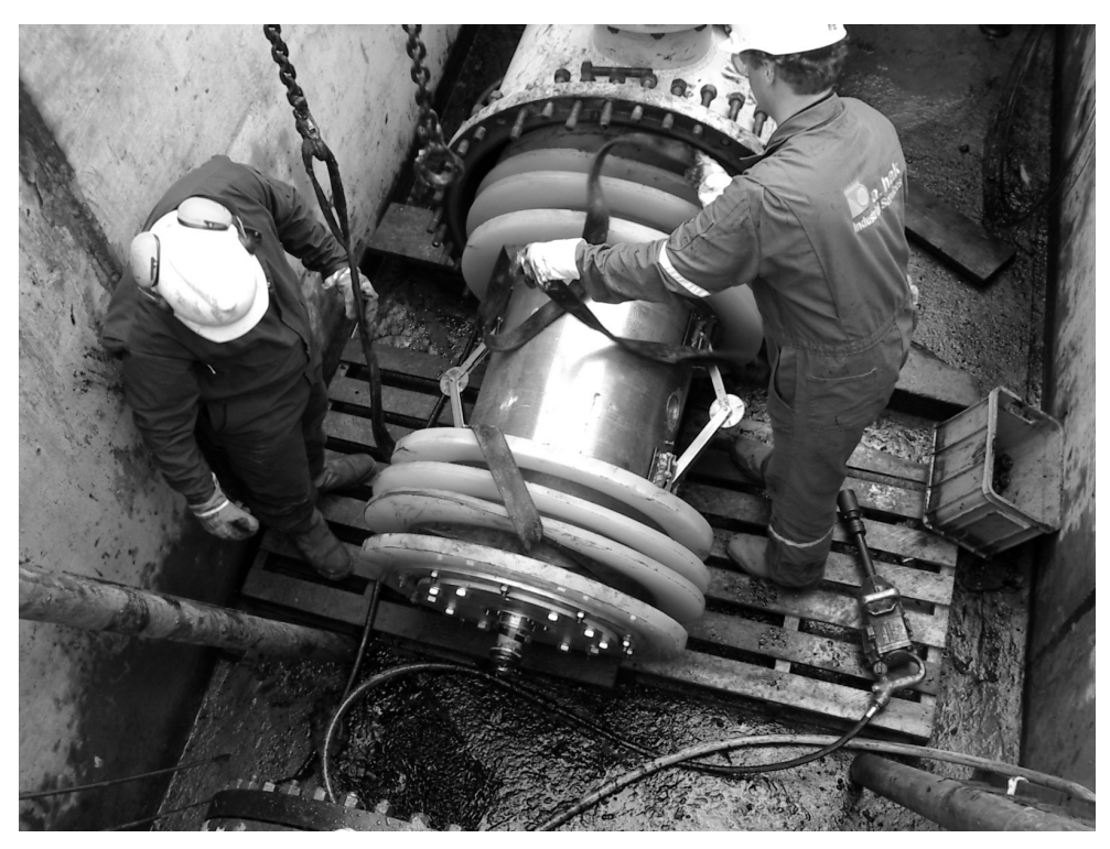
Figure 3: Manoeuvring the Ultrasonic Pig into the Pipeline