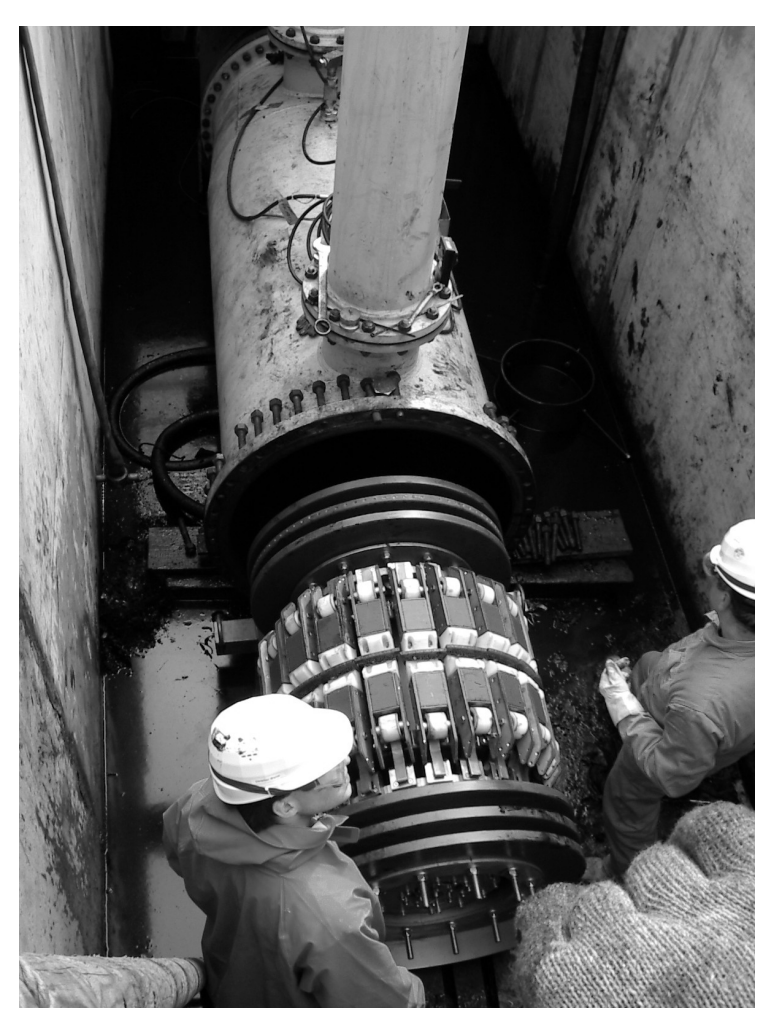
Figure 4: Manoeuvring the Magnetic Flux Leakage Pig into the Pipeline