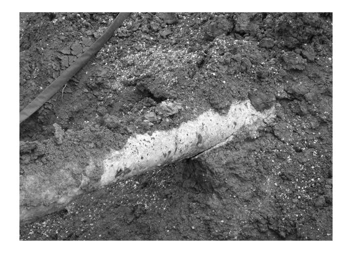
Figure 4 – Bare Pipe uncovered as a result of data Captured and analyzed during the CPCM test run